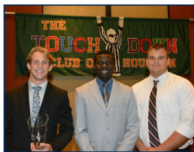
Photo taken by Houston Chronicle photographer as featured on chron.com of this year's recognized scholar athletes

This week, I served as the keynote speaker at the Touchdown Club of Houston's Scholar Athlete's Luncheon. This event was held at the J.W. Marriott, Liberty Hall, located on Westheimer and was featured on the Houston Chronicle's chron.com .